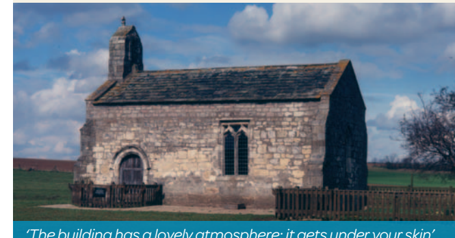
The building has a lovely atmosphere; it gets under your skin'