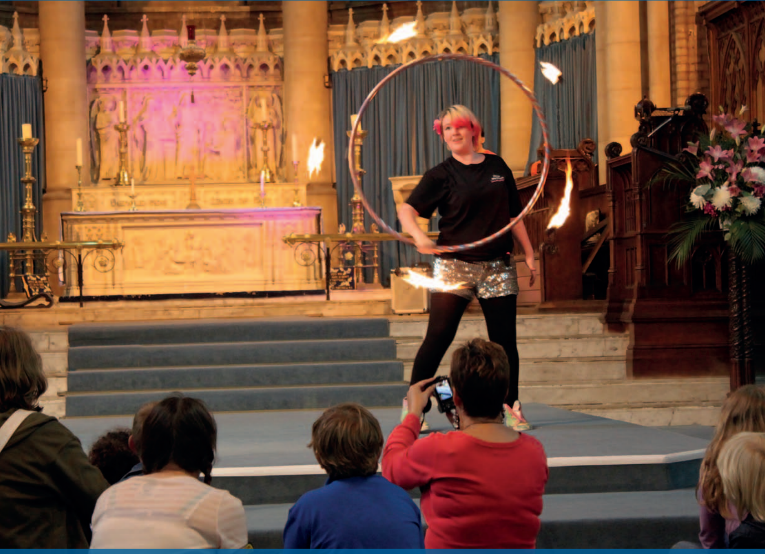
Performer from Circus Brighton at the open day in St Mary's church, Kemp Town, Brighton

"It's a great opportunity for me to do something more for our community, and develop new skills for my future."