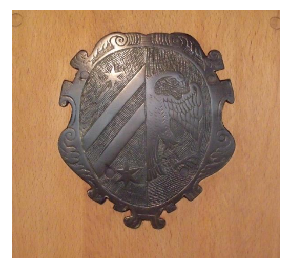
Church of St John Maddermarket, Norwich, Norfolk