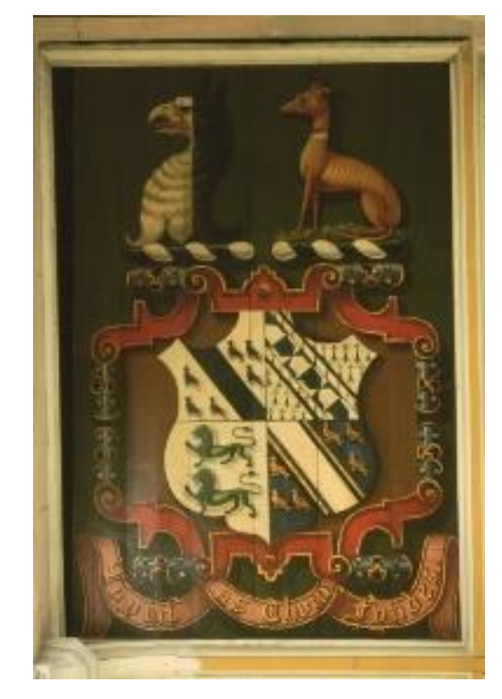
Holy Trinity Church, Blackburn, Lancashire