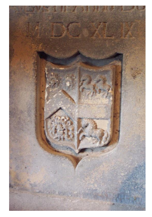
Holy Trinity Church, Wentworth, South Yorkshire

All Saints' Church, Haugham, Lincolnshire