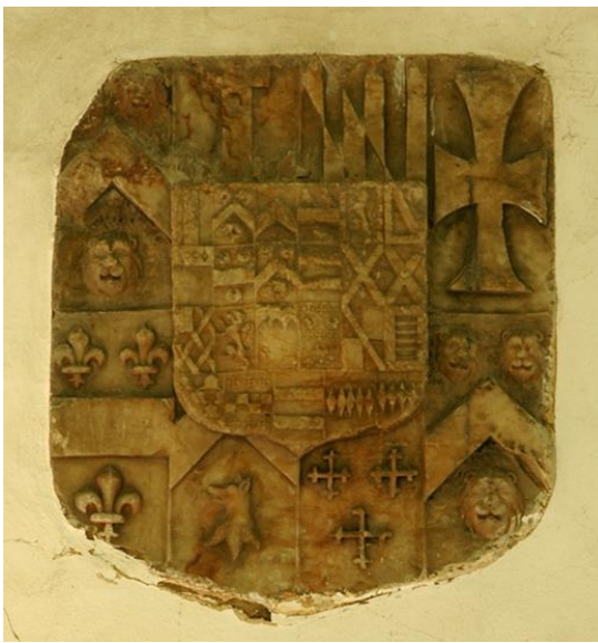
Holy Trinity Church, Wentworth, South Yorkshire