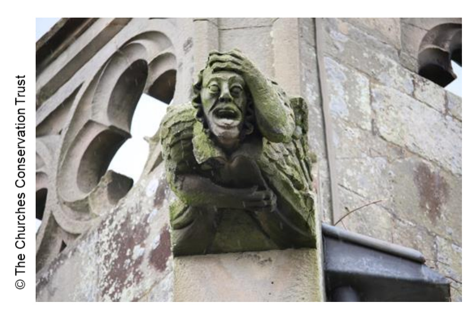
Church of St Mary Magdalene, Battlefield, Shropshire