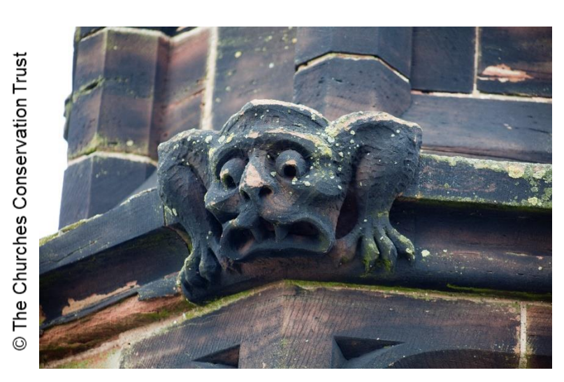
Christ Church, Waterloo, Merseyside