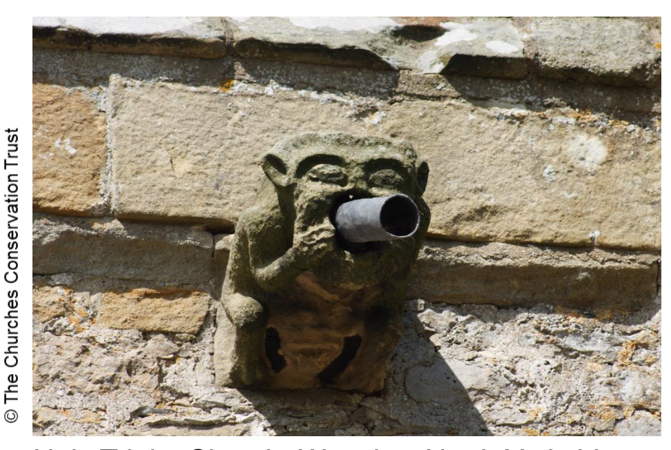
Holy Trinity Church, Wensley, North Yorkshire