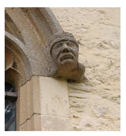
Church of St Mary the Virgin, Wiggenhall, Norfolk