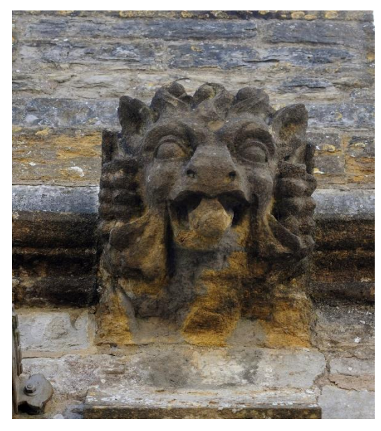
All Saints Church, Langport, Somerset