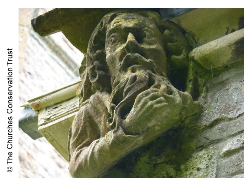
St Nicholas Church, Brockley, Somerset