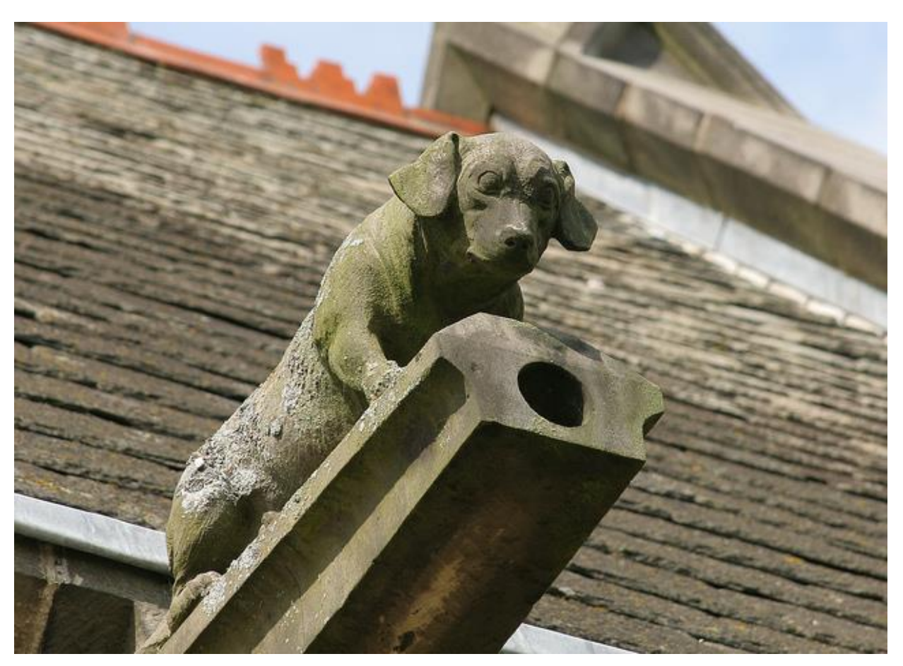
Church of Christ the Consoler, Skelton-cum-Newby, North Yorkshire