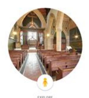
All Saints' Church, Cambridge