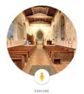
St Lawrence's Church, Broughton