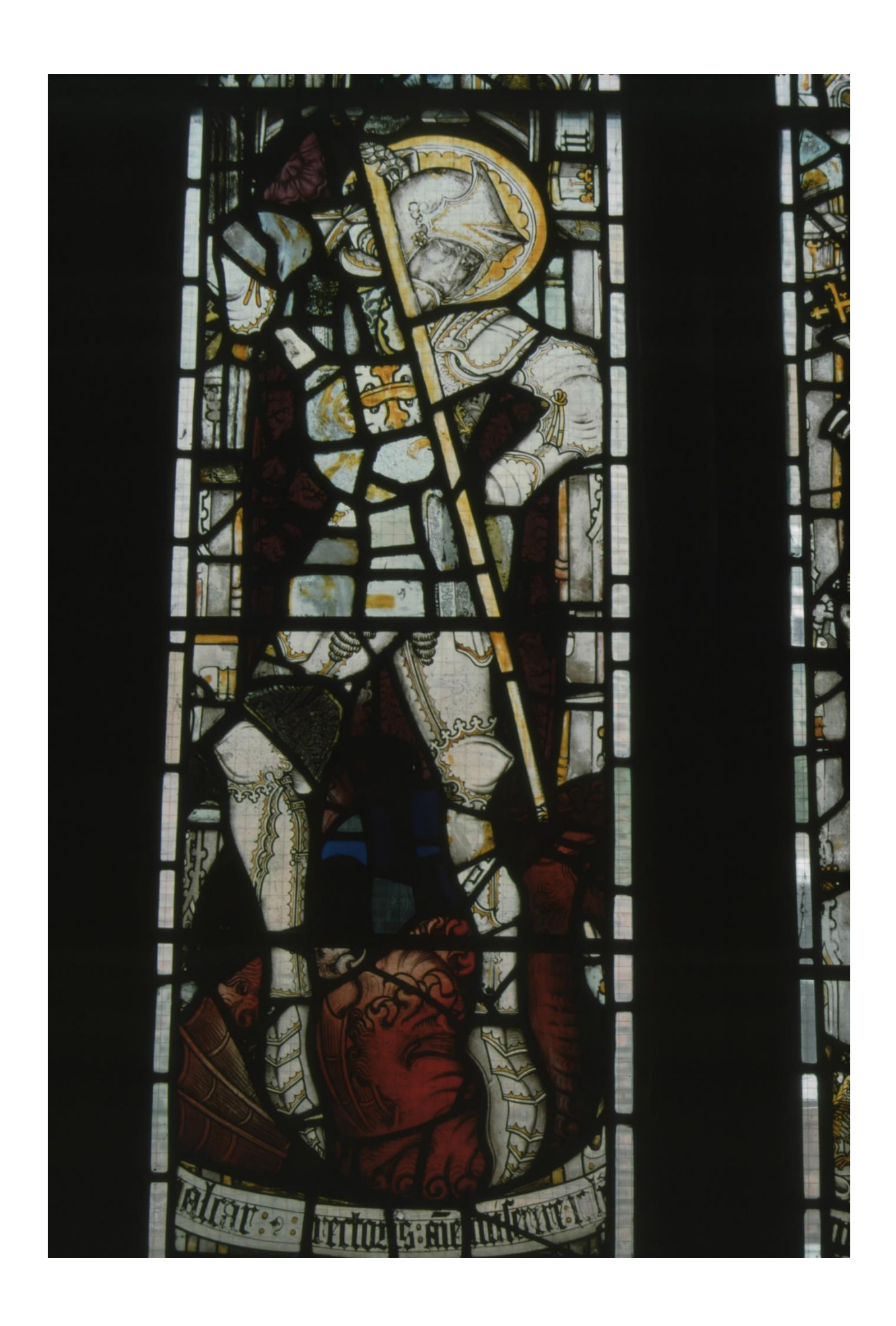
Holy Trinity, York