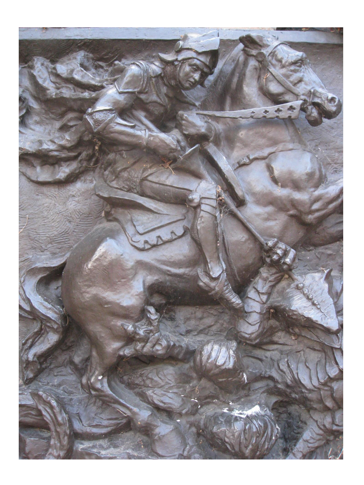
St Mary's, Sandwich