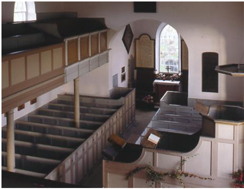
St Stephen's Church, Fylingdales

All of our churches are listed, mostly Grade I, and some are Scheduled Ancient Monuments. Our collection - the third largest of heritage buildings in the country - carries national historic, architectural and cultural significance.