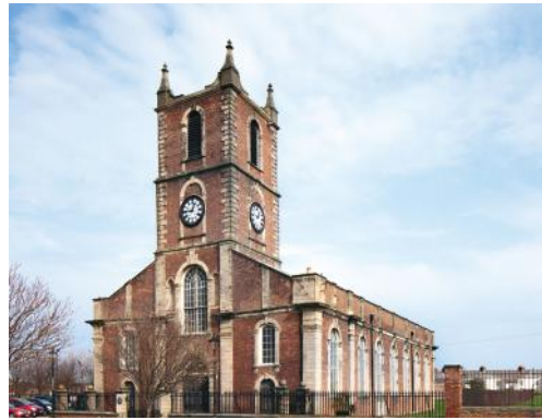
Holy Trinity, Sunderland

We want to prevent the historic parish church from becoming irrelevant and ensure they are valued for generations to come. We aim not only to save historic church buildings but to find new uses that give these spaces a fresh lease of life.