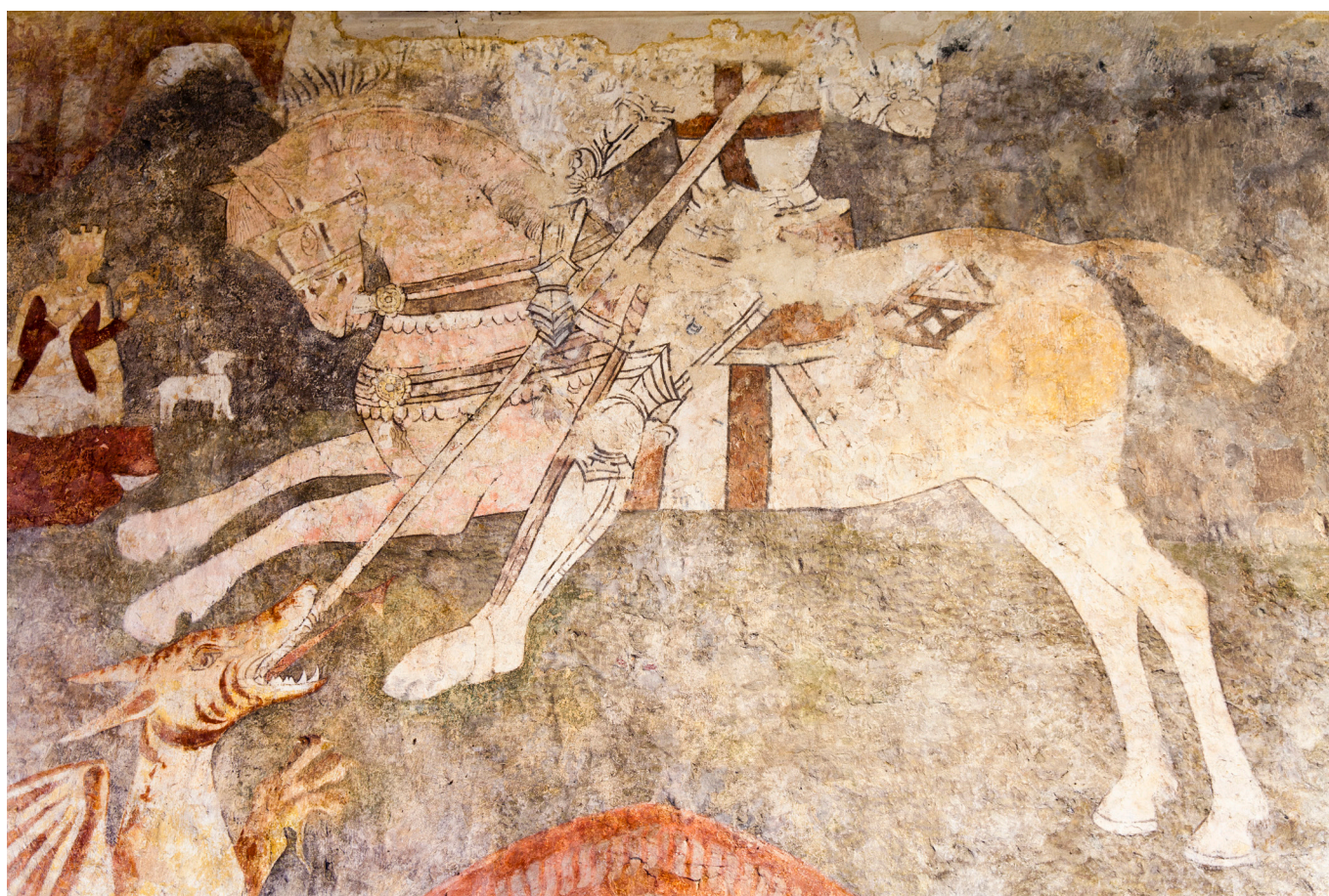
A mural of St George and the Dragon at St Lawrence's, Broughton