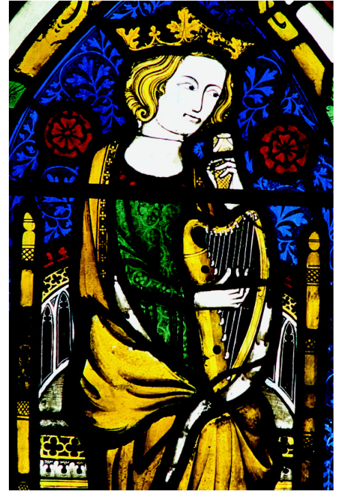
Stained glass at St Mary the Virgin, Shrewsbury