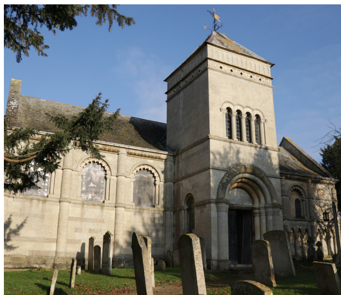
The Church of St Peter, Tickencote, Rutland

The church is now open and can be enjoyed by all. It is cared for greatly by the local community in the village of Tickencote and hosts a small library inside the church. St Peter's attracts, and will continue to attract, visitors from all over because of its rare and beautiful Norman architecture. It is a favourite for groups to visit, including Leicester Cathedral walking group.