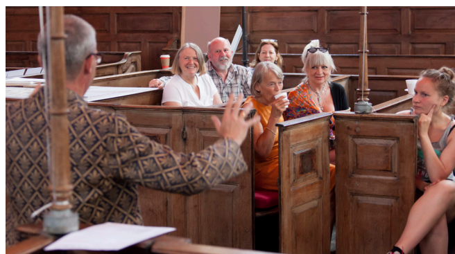
St Swithun's, Worcester

As is reflective of the current heritage sector, the number of visitors to our sites remains below pre-pandemic levels. However, we remain committed to working with communities to support their plans to encourage greater use of our buildings. We are optimistic that with their support the number of people enjoying these spaces will soon exceed our previous heights.