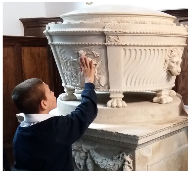
St Nicholas' Chapel, Kings Lynn

Thank you once again to all those who supported our 2022-23 Annual Appeal. With our help and with your support the 357 churches in our care remain open and in use – living once again at the heart of their communities.