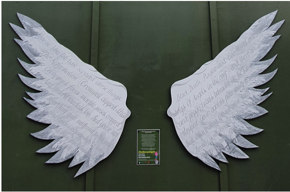
Wings on the the hoardings of St Peter's Church, Sudbury