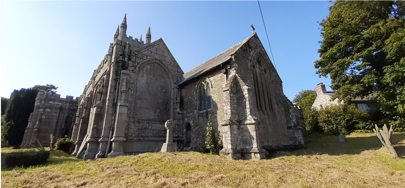
St Torney's Church, North Hill, Cornwall

The 90ft-tower of St Torney's Church in North Hill, Cornwall, rises above the surrounding landscape and has formed part of the historic skyline of North Hill for centuries. The first recording of an incumbent at St Torney's was in 1260, and since that time it has been elegantly developed upon, especially during the 15th and 17th centuries.