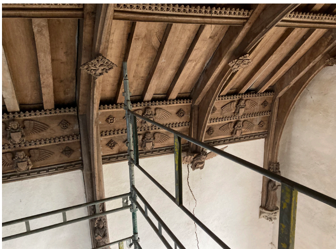
Stonham Parva during HSF works

This urgent conservation work has not only saved this historic church for future generations but has revealed details of the hammerbeam roof that likely have not been seen for centuries, such as the high level of detailed carving on the beams. CCT is delighted that St Mary's Church is once again safe to be open to the public, for the local community to use and enjoy for events and services.