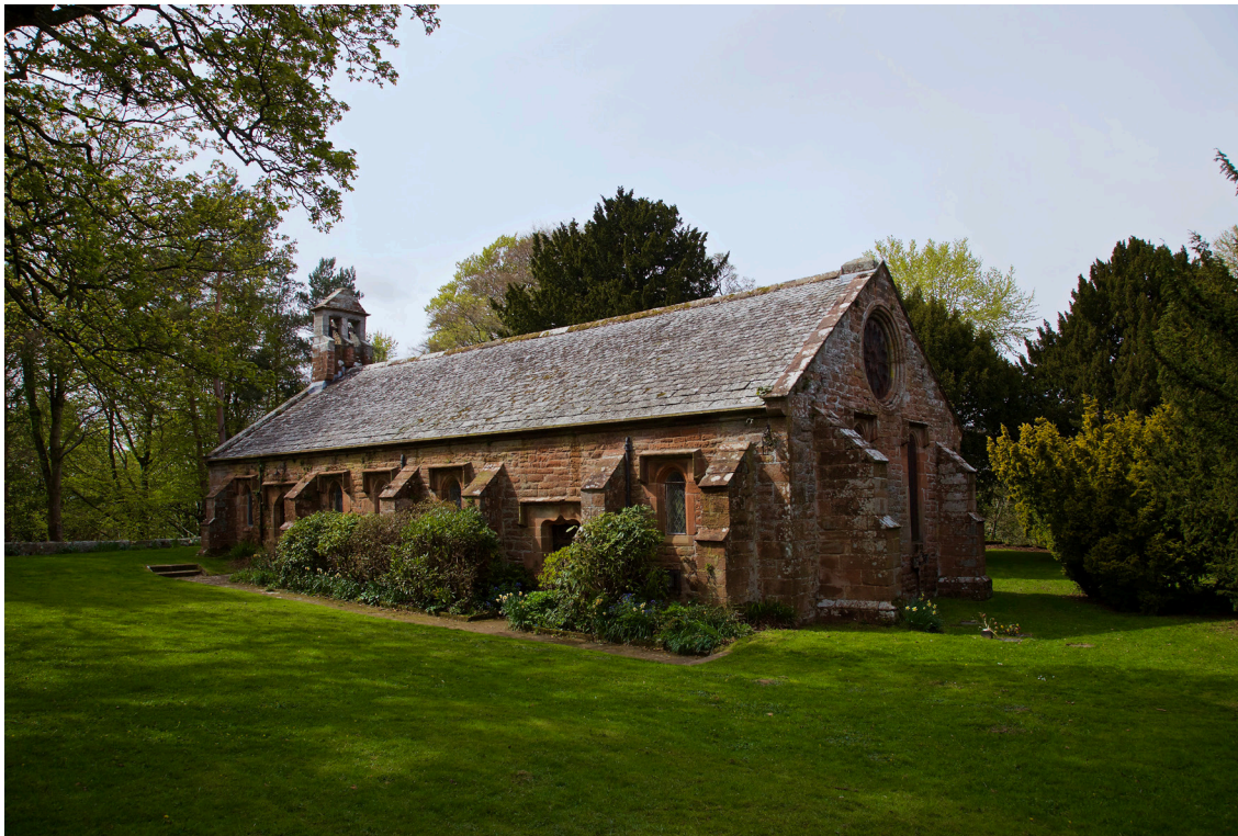
Exterior of St Wilfrid's Church, Brougham

The Chapel of St Wilfrid at Brougham, near Penrith in Cumbria, was vested into the care of CCT in spring 2023. St Wilfrid's is in good company, joining its historic parish church, St Ninian's, which has been in the care of CCT since 1979.