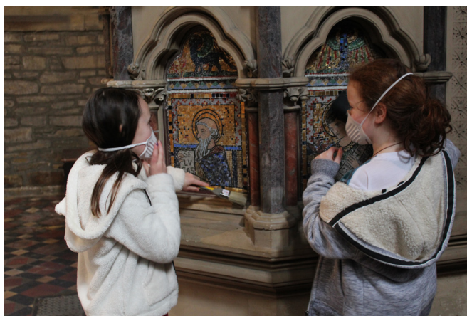
St Stephen's, Copley

At CCT, we hold our members, donors, volunteers, and other supporters who fund our work in the highest regard. Due to their loyal support this past year our Appeal raised £33,090 (with an additional £4,362 from Gift Aid). This support has allowed us to invest further in providing creative ways to deliver the school curriculum, welcoming vulnerable individuals to our safe spaces, and teaching heritage craft skills to support career development for young people.