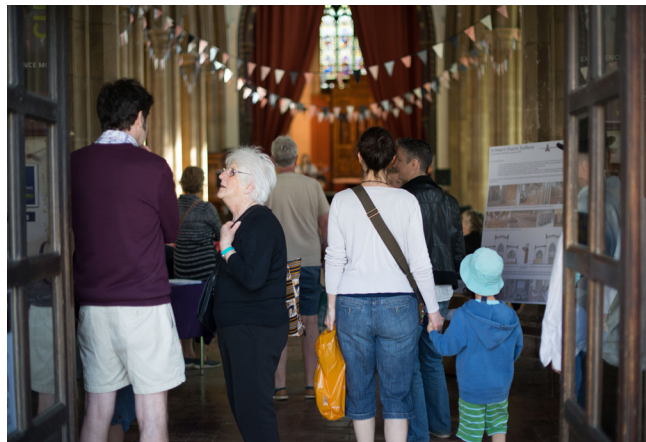
St Peter's, Sudbury

As a small gesture of thanks to these church communities, each spring we host an awards evening that celebrates their achievements. This event is held in partnership with the Marsh Charitable Trust and recognises various activities, ranging from fundraising to digital innovations, to community impact. More information about the winners and their triumphs can be found on pages 10 and 11.