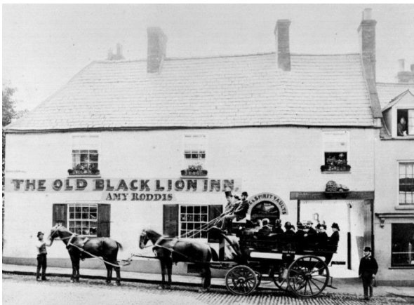
Historic image of the Old Black Lion

We were delighted to announce that our project at Holy Trinity Church, Sunderland, won 'Restoration or Conservation Project of the Year' at the Museum and Heritage Awards 2022, the first of many awards to come. The project transformed Sunderland's first parish church and civic hub into a spectacular space for connecting people and sharing stories and heritage through conservation repair and sensitive adaptation.