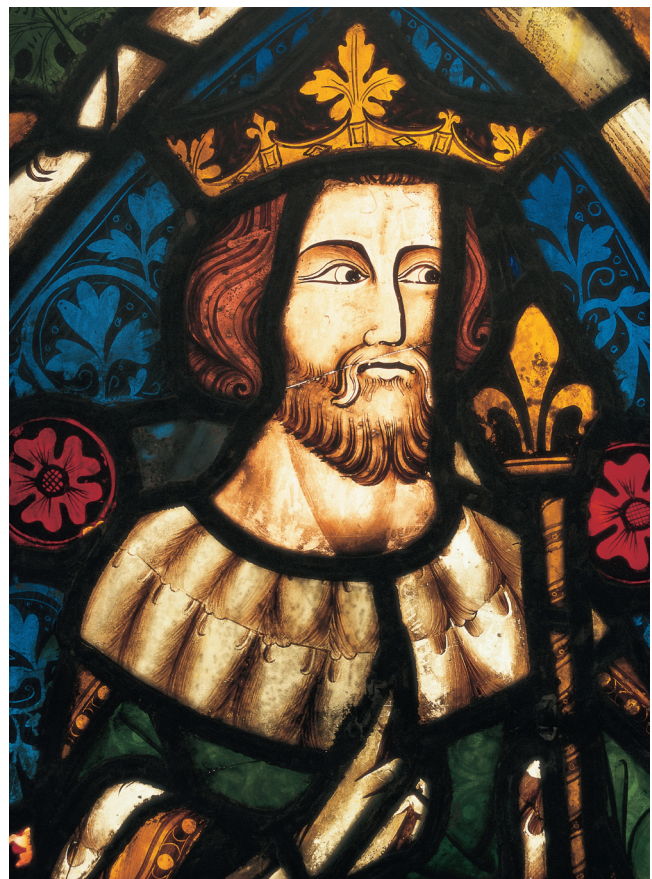
King in Majesty at St Mary the Virgin, Shrewsbury

As well as support from the National Lottery Heritage Fund, project costs of £353,000 were met with the generous support of individual donors and through events at St Mary's, for which the Churches Conservation Trust is truly grateful.